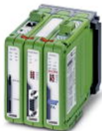
PROFIBUS DP to PROFIBUS PA coupler

Please be informed that the data shown in this PDF Document is generated from our Online Catalog. Please find the complete data in the user's documentation. Our General Terms of Use for Downloads are valid ( http://phoenixcontact.com/download )